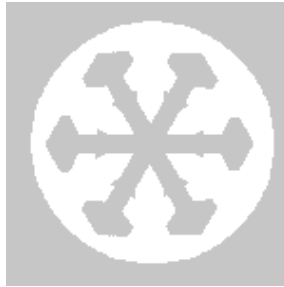
Stellar Crystal with Sectorlike Ends