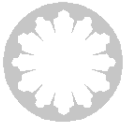
Broad Branch Crystal with 12 Branches