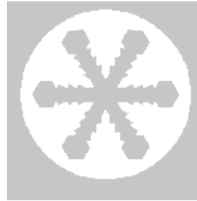
Dendritic Crystal with Plates at Ends