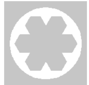
Crystal with Broad Branches