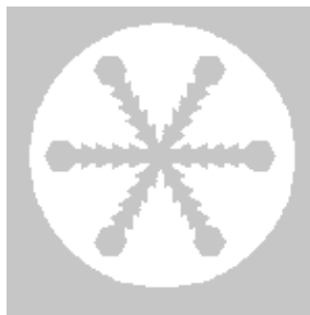
Dendritic Crystal with Plates at Ends