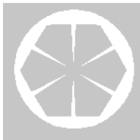
Crystal with Sectorlike Branches