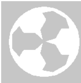
Bullet with Plate Ends