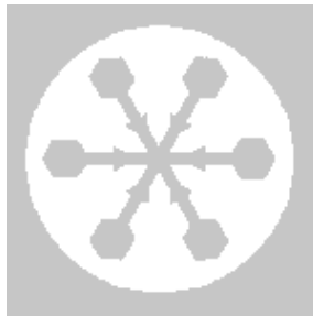
Stellar Crystal with Plates at Ends