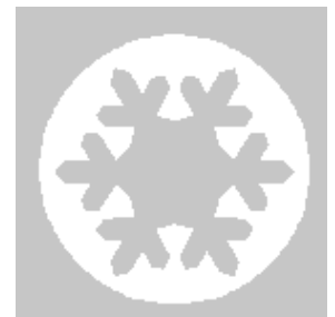
Plate with Dendritic Extensions