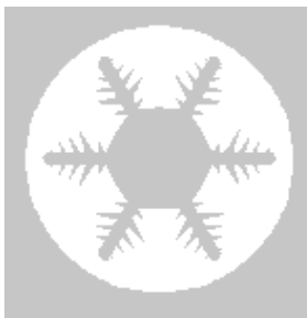
Plate with Dendritic Extensions